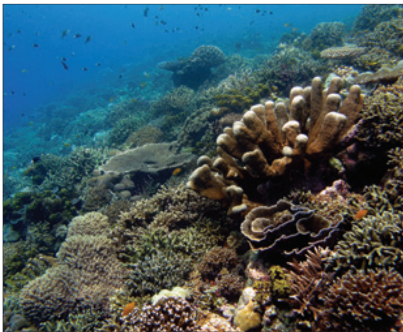
Figure 1. Indicators of coral reef resilience include high recruitment, high diversity, broad size/age range, healthy and disease-free corals, healthy populations of herbivorous fishes, and a history of surviving stress.

change (Holling 1973; Nyström and Folke 2001). For coral reefs, resilience relates to a reef ecosystem's ability to recover from a disturbance, to maintain the dominance of hard corals, and/or to maintain morphological diversity as opposed to shifting to an algal-dominated state or a single coral morphology (Marshall and Schuttenberg 2006). Indicators of resilience in coral reefs include high periodic recruitment, healthy and disease-free corals, a range of coral colony sizes and ages (suggesting persistence and recruitment over time), and robust populations of herbivorous fishes (Figure 1).