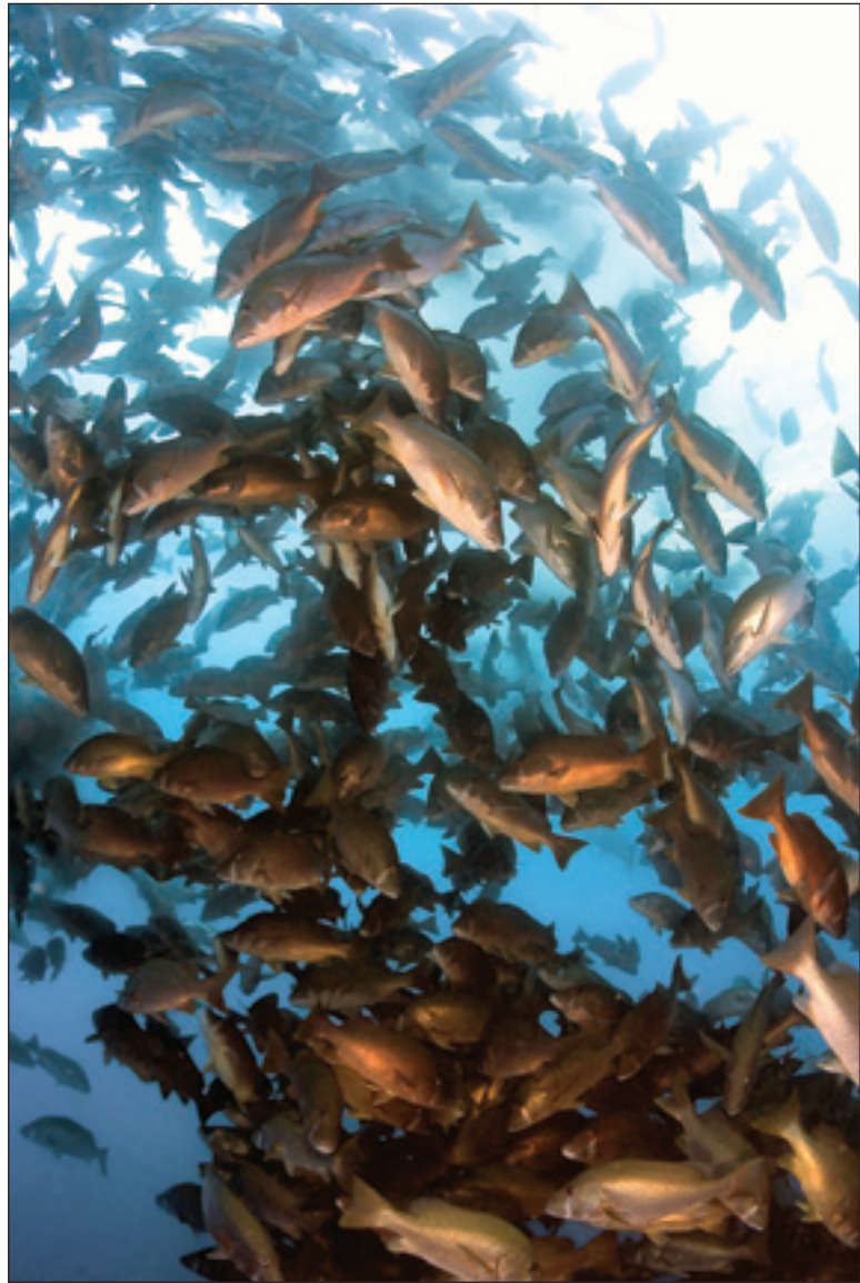
Figure 2. Critical areas, such as fish spawning aggregation sites, are essential for maintaining ecosystem function and need to be protected in MPAs.

Berkelmans et al. 2004; Wooldridge and Done 2004; Golbuu et al. 2007). These reefs merit greater representation in MPA networks as they demonstrate greater resilience to bleaching events relative to reefs in clearer or deeper waters. Sites where these factors reliably occur are critical components of MPA networks.